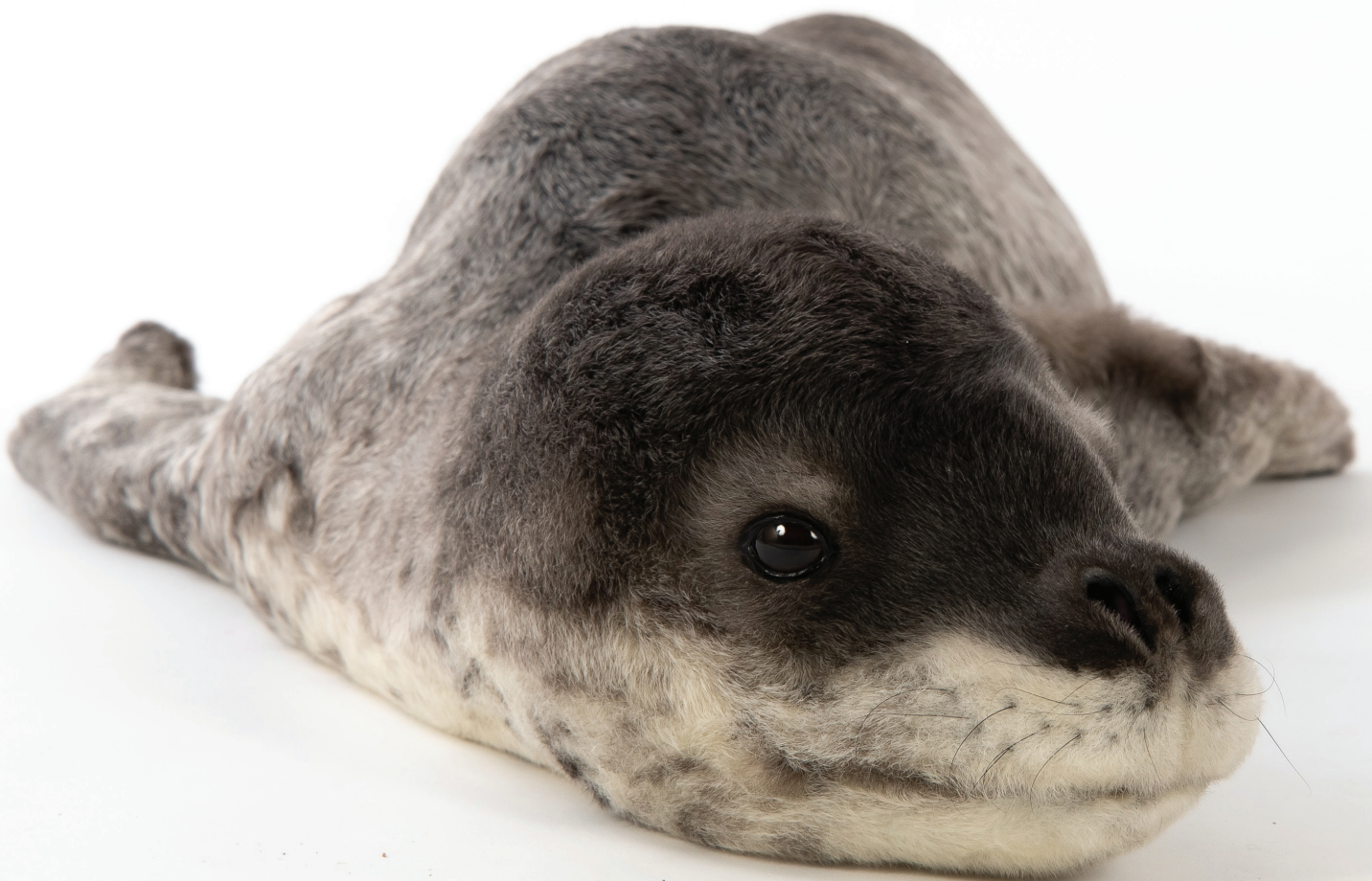
Kana, leopard seal pup ( Hydrurga leptonyx ), Dunedin, VT3328