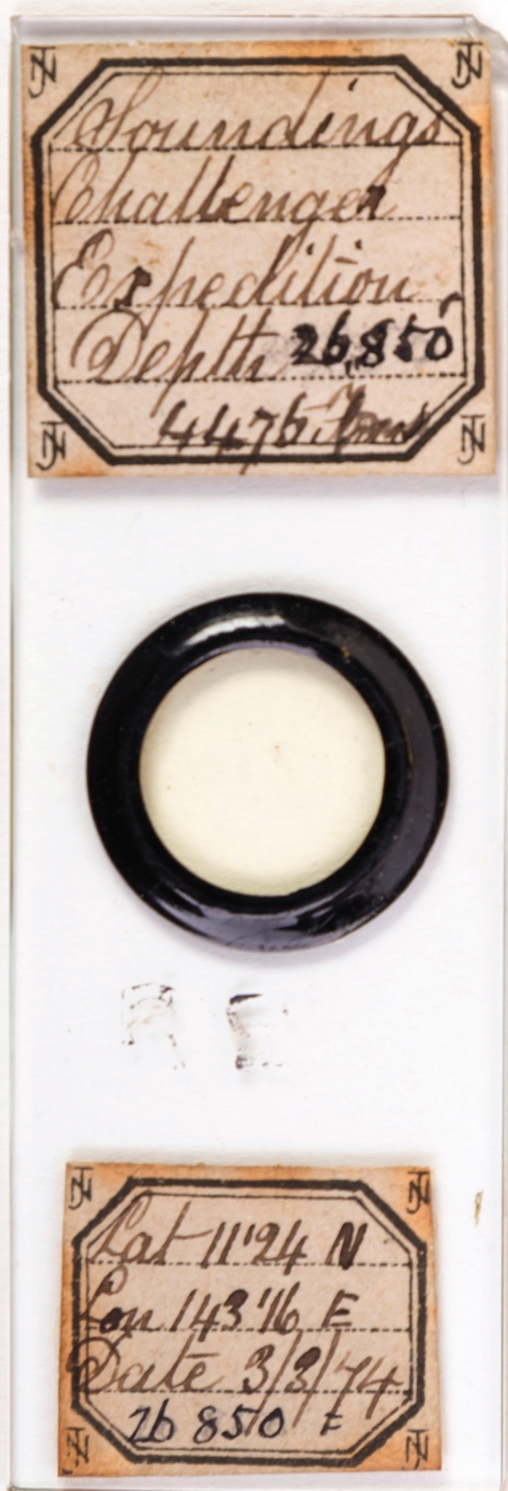
Radiolaria, cleaned, bleached, and mounted on a glass slide Pacific Ocean, off the coast of Guam, Challenger Expedition, 1872 to 1876, GL2528

Some of the smallest specimens in our collection come from one of the biggest ocean expeditions ever undertaken